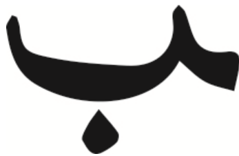
Figure 1 | The Arabic letter Baa’, in the final form

We think 2020-21 growth trajectories are better described by the Arabic letter ‘Baa’, in its final form (Figure 1). In an age of lower secular growth trends, low rates, older demographics and higher debt, the elongated horizontal sweeps of the Arabic alphabet seem a better fit than western equivalents.