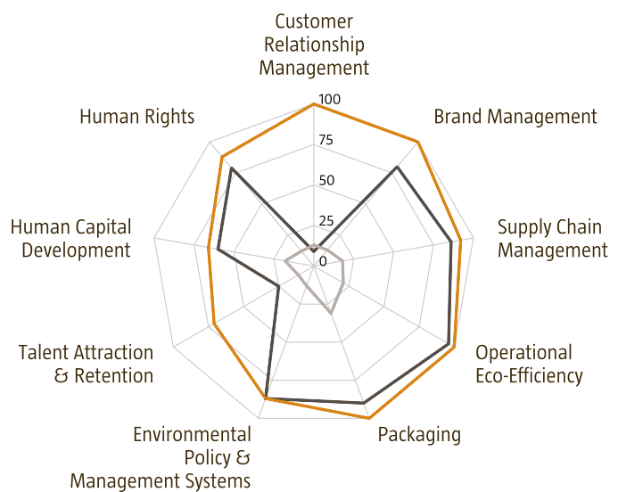
Industry best score Industry average score Industria de Diseno Textil SA

RobecoSAM has selected the most relevant criteria in each sustainability dimension based on their weight in the assessment and their current or expected significance for the industry. The spider chart below visualizes the performance of the industry leader against the best score achieved in each criterion and the median industry score.