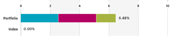
Portfolio exposure to ESG-Labeled Bonds

The ESG-labeled bond chart displays the portfolio's exposure to ESG-labeled bonds. Specifically, green bonds, social bonds, sustainability bonds, and sustainability-linked bonds. This is calculated as a sum of weights for those bonds in the portfolio that have one of above mentioned labels. Index exposure figures are provided alongside the portfolio exposure figures, highlighting the difference with the index.