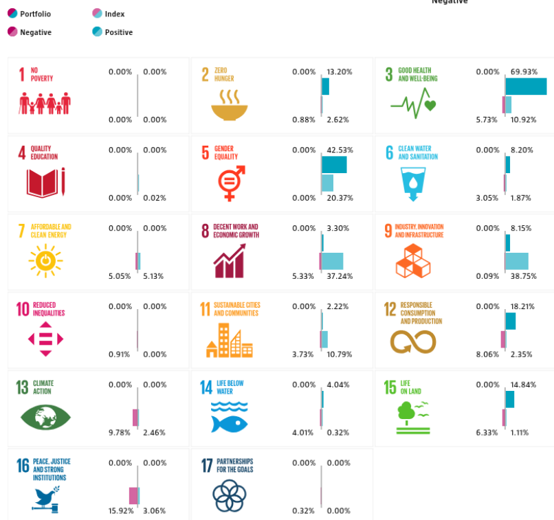
Data derived from internal processes.