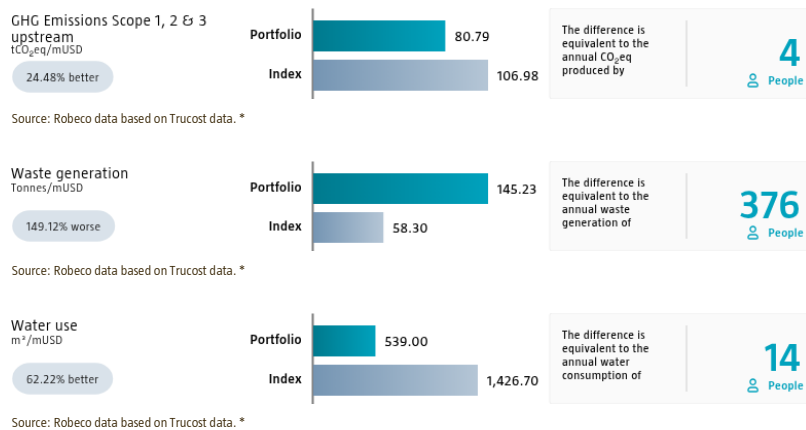
* Source: S&P Global Market Intelligence data © Trucost 2026. All rights in the Trucost data and reports vest in Trucost and/or its licensors. Neither S&P Global Market Intelligence, nor its affiliates, nor its licensors accept any liability for any errors, omissions or interruptions in the Trucost data and/or reports. No further distribution of the Data and/or Reports is permitted without S&P Global Market Intelligence's express written consent. Reproduction of any information, data or material, including ratings is prohibited. The content is not a recommendation to buy, sell or hold such investment or security, nor does it address suitability of an investment or security and should not be relied on as investment advice.

Environmental footprint expresses the total resource consumption of the portfolio per mUSD invested. Each assessed company's footprint is calculated by normalizing resources consumed by the company's enterprise value including cash (EVIC). We aggregate these figures to portfolio level using a weighted average, multiplying each assessed portfolio constituent's footprint by its respective position weight. For comparison, index footprints are shown besides that of the portfolio. The equivalent factors that are used for comparison between the portfolio and index represent European averages and are based on third-party sources combined with own estimates. As such, the figures presented are intended for illustrative purposes and are purely an indication. Only holdings mapped as corporates are included in the figures.