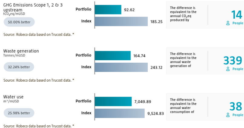
* Source: S&P Global Market Intelligence data © Trucost 2026. All rights in the Trucost data and reports vest in Trucost and/or its licensors. Neither S&P Global Market Intelligence, nor its affiliates, nor its licensors accept any liability for any errors, omissions or interruptions in the Trucost data and/or reports. No further distribution of the Data and/or Reports is permitted without S&P Global Market Intelligence's express written consent. Reproduction of any information, data or material, including ratings is prohibited. The content is not a recommendation to buy, sell or hold such investment or security, nor does it address suitability of an investment or security and should not be relied on as investment advice.

Environmental footprint expresses the total resource consumption of the portfolio per mUSD invested. Each assessed company's footprint is calculated by normalizing resources consumed by the company's enterprise value including cash (EVIC). We aggregate these figures to portfolio level using a weighted average, multiplying each assessed portfolio constituent's footprint by its respective position weight. For comparison, index footprints are shown besides that of the portfolio. The equivalent factors that are used for comparison between the portfolio and index represent European averages and are based on third-party sources combined with own estimates. As such, the figures presented are intended for illustrative purposes and are purely an indication. Only holdings mapped as corporates are included in the figures.