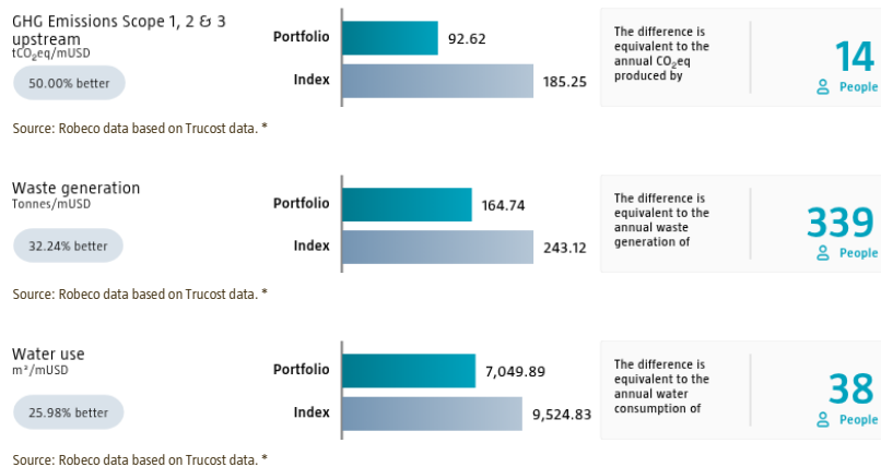
* Source: S&P Global Market Intelligence data © Trucost 2026. All rights in the Trucost data and reports vest in Trucost and/or its licensors. Neither S&P Global Market Intelligence, nor its affiliates, nor its licensors accept any liability for any errors, omissions or interruptions in the Trucost data and/or reports. No further distribution of the Data and/or Reports is permitted without S&P Global Market Intelligence's express written consent. Reproduction of any information, data or material, including ratings is prohibited. The content is not a recommendation to buy, sell or hold such investment or security, nor does it address suitability of an investment or security and should not be relied on as investment advice.

Environmental footprint expresses the total resource consumption of the portfolio per mUSD invested. Each assessed company's footprint is calculated by normalizing resources consumed by the company's enterprise value including cash (EVIC). We aggregate these figures to portfolio level using a weighted average, multiplying each assessed portfolio constituent's footprint by its respective position weight. For comparison, index footprints are shown besides that of the portfolio. The equivalent factors that are used for comparison between the portfolio and index represent European averages and are based on third-party sources combined with own estimates. As such, the figures presented are intended for illustrative purposes and are purely an indication. Only holdings mapped as corporates are included in the figures.